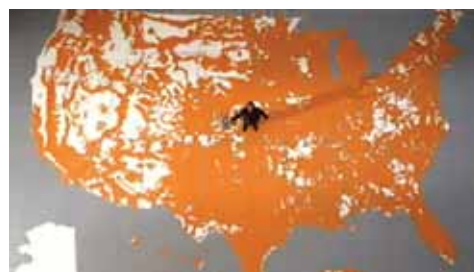
Screen shot of AT&T commercial.